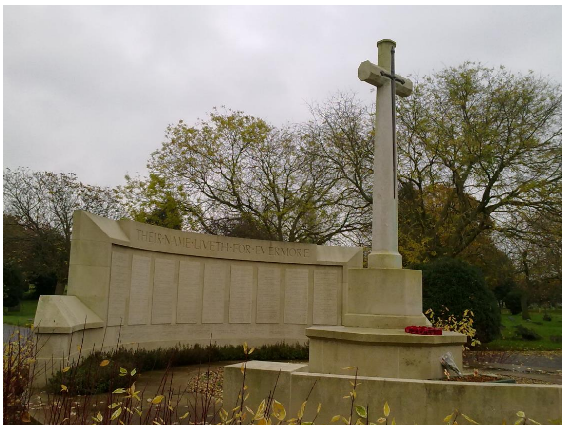
Cross of Sacrifice, Streatham Cemetery