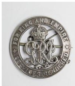
Silver War Badge