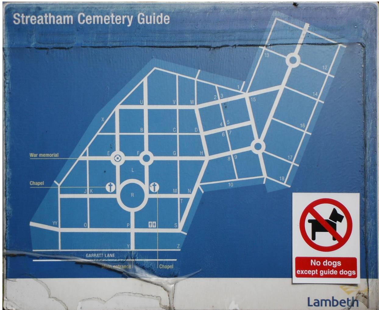
Map of Streatham Cemetery